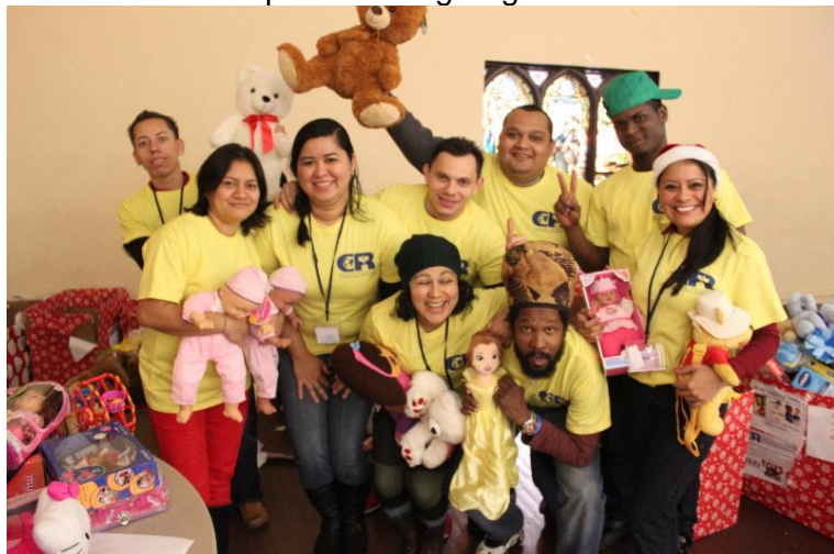
The morning student government at the Harvard Street

This past holiday season, students and staff took their work outside the school walls with three events that showcased the importance of giving.