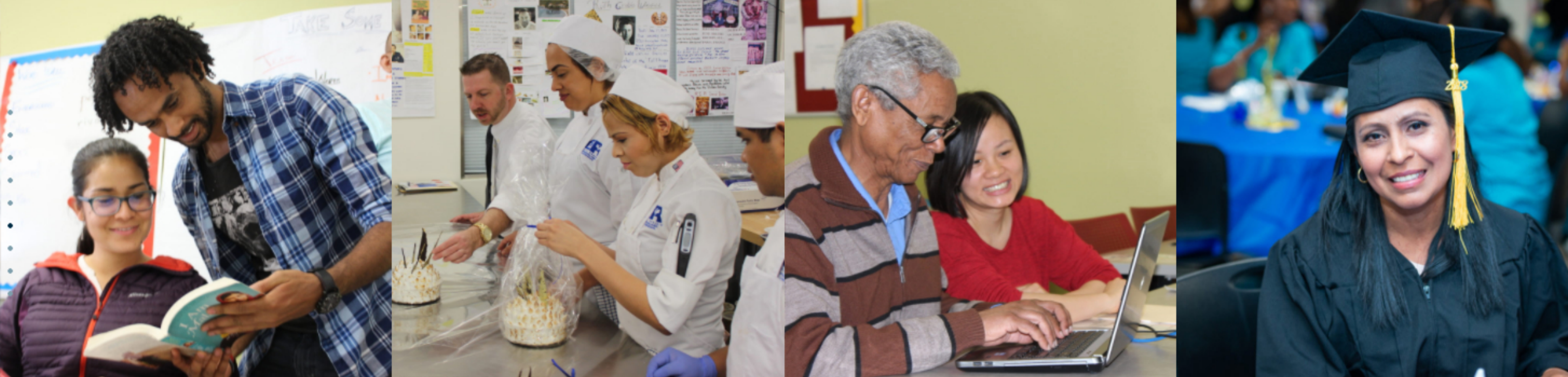
English as a Second Language